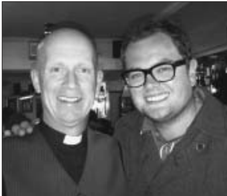
Alan Carr seems to make Glyn happy!

Still not sure if measuring it, will make it happen. What do you think?