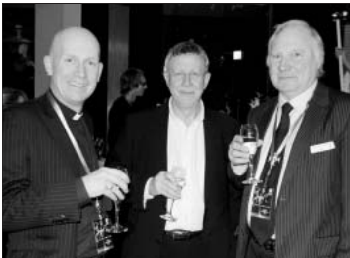
The opening of St Andrew's Mall named after St Andrew's Church